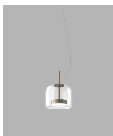
JUBE SP 1 P