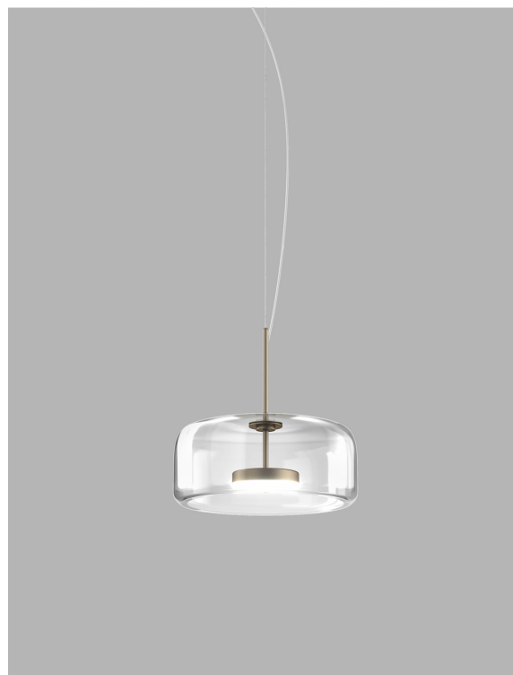
JUBE SP 1 G CRTR AVS L22 02 CE