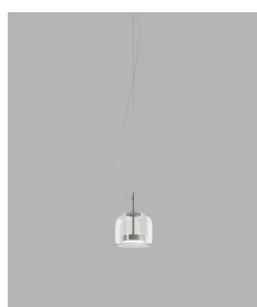
JUBE SP S